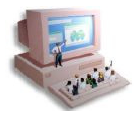
Figure 2. Name of the figure

Lettering and symbols should be clearly defined either in the caption or in a legend provided as part of the figure. Figures should be placed at the top or bottom of a column wherever possible, and as close as possible to the first reference to them in the paper. Leave one line space between the heading and the figure. Figures must be 300 dpi quality.